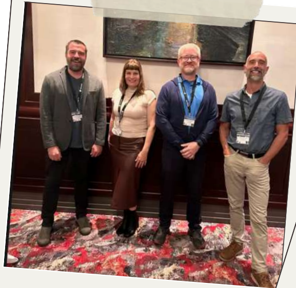
Learning from our Regional Medical Directors