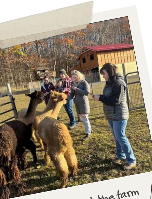
Team bonding at the farm