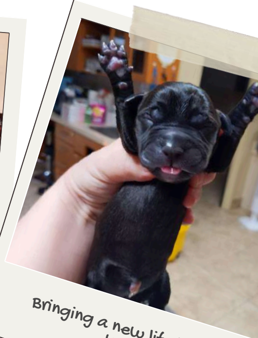
Bringing a new life into the world!